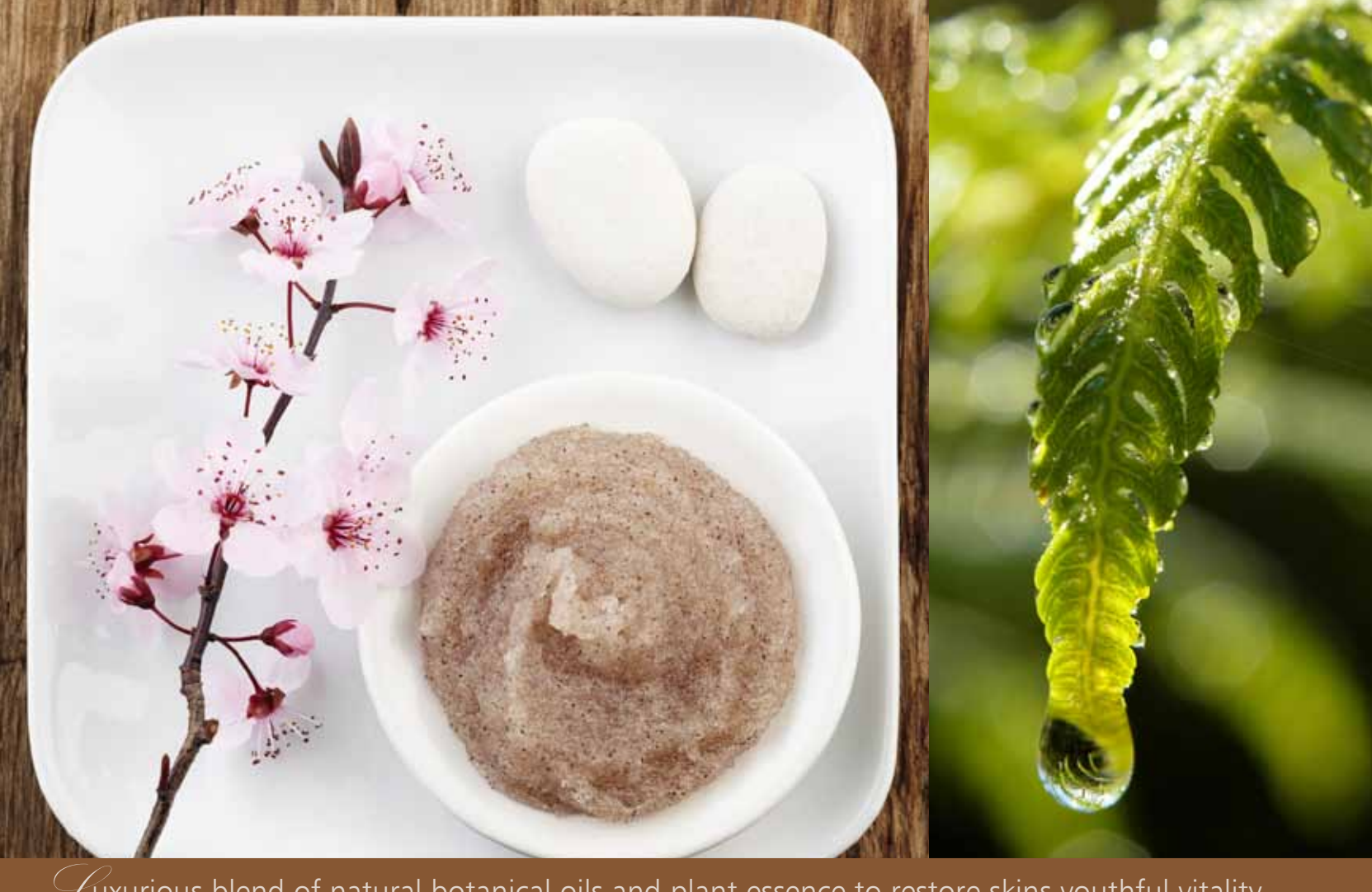
Juxurious blend of natural botanical oils and plant essence to restore skins youthful vitality.