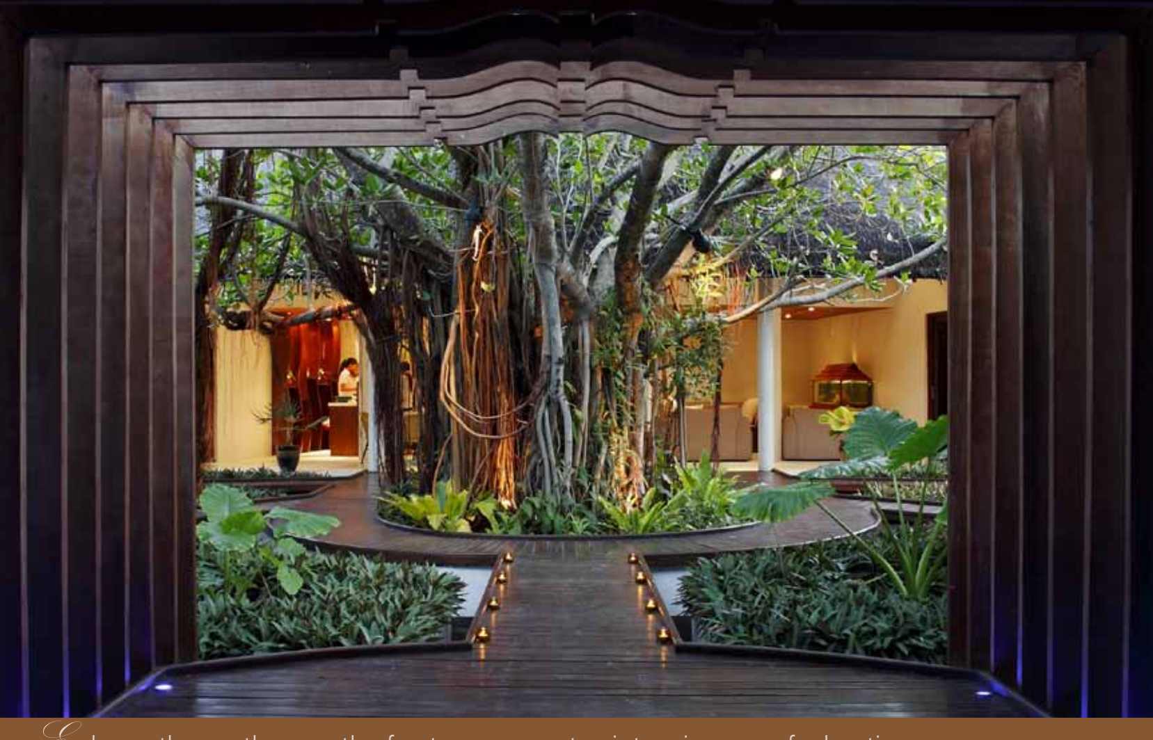
Embrace the gentle warmth of nature as you step into a journey of relaxation.