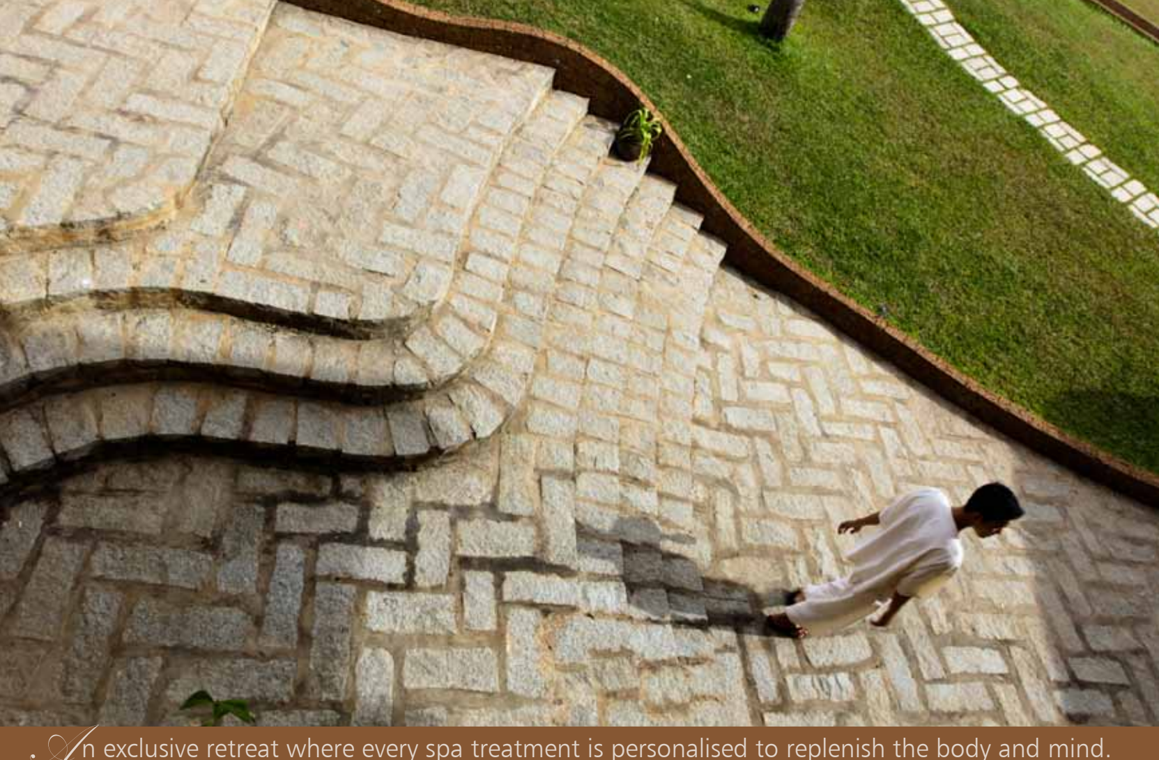
In exclusive retreat where every spa treatment is personalised to replenish the body and mind.