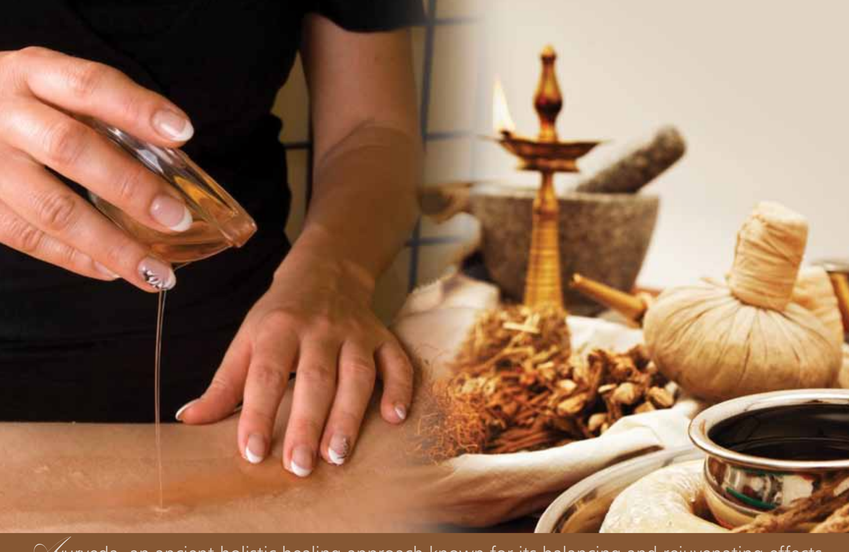
yurveda, an ancient holistic healing approach known for its balancing and rejuvenating effects.